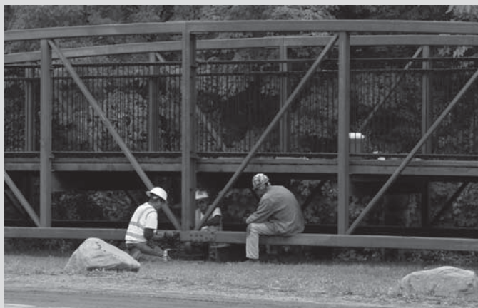
On September 28 the prefabrication bridge was placed over the Johnson Creek.