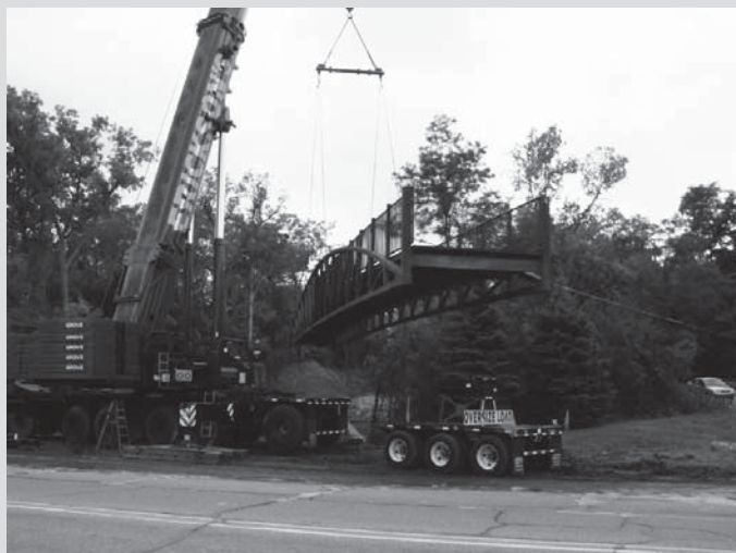
Crane lifts preassembled bridge into place